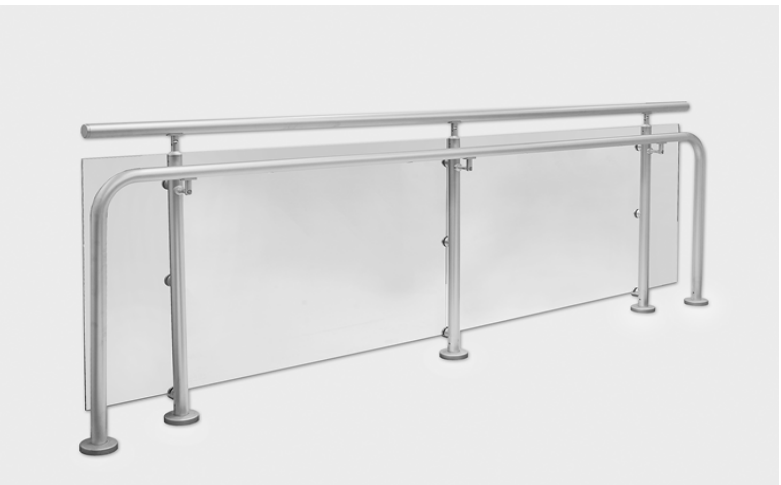
Interna-Light™ with VUE Glass Infill Panel Railing